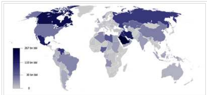
Oil - proved reserves.

This is a list of countries by proven reserves of oil based on The World Factbook as of 2010-07-05